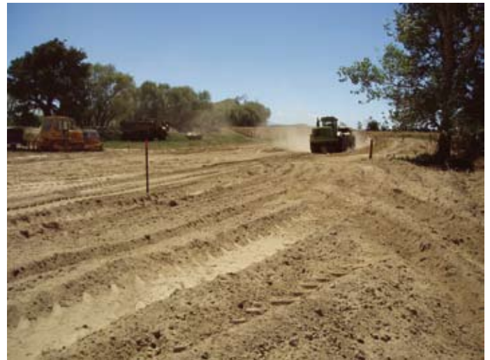
Stopbank construction at Mahaki