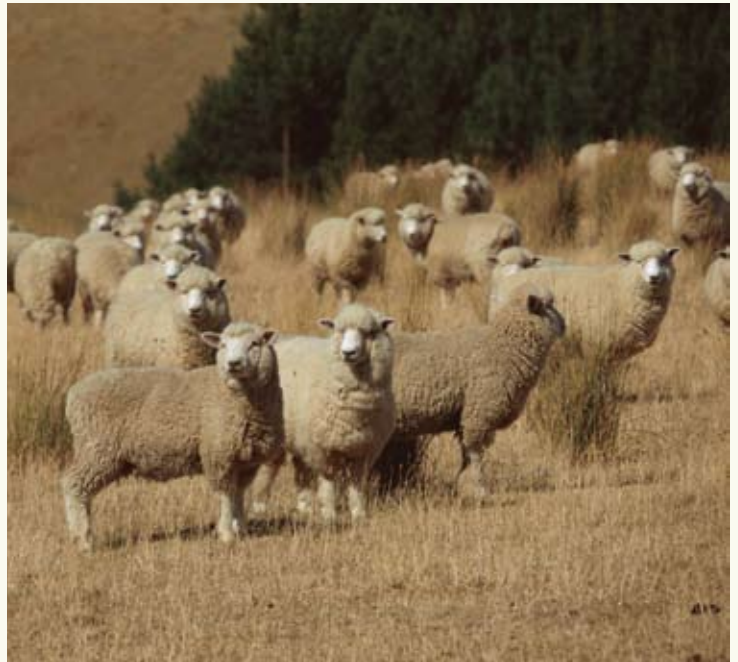
Last year the farm wintered 6,921 sheep