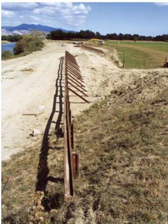
Debris fence construction in front of the Hikinui sill