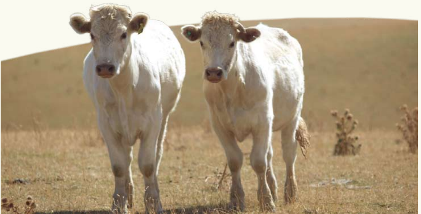
Charolais cattle on the Harvey's farm

The Harveys have also been quick to spot opportunities. Rising demand for grape growing land in the 1990s saw them sell off 32ha of light, stony land in four blocks – a move that allowed them to clear their mortgages and develop the property into the profitable business it is today.