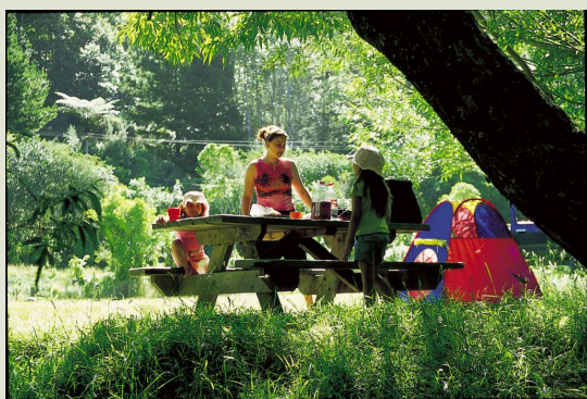
Picnic in corner paddock – Jessica Dewsnap

Site of one of the last battles between Maori and colonial forces in the region, Battle Hill blends traditional hill country farming, forestry and environmental restoration. With its mix of flat and steeper country it is popular for walking, biking, horse riding, camping and picnicking.