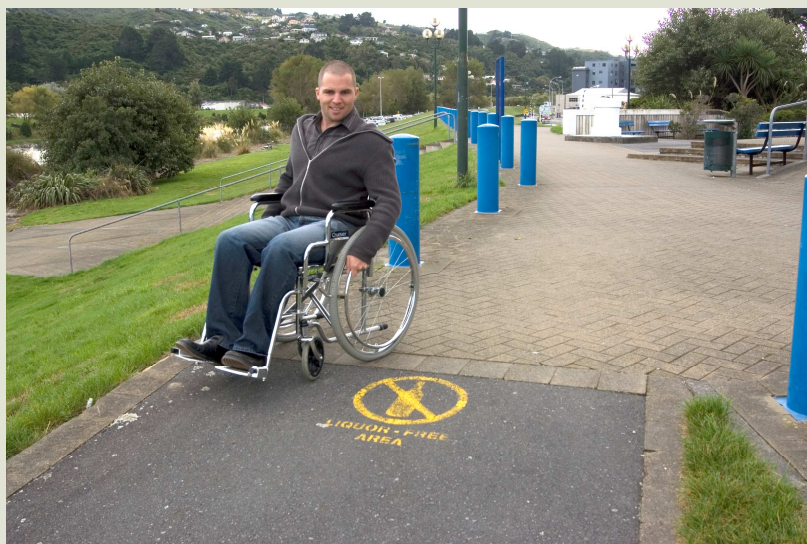
On the Trail just south of Lower Hutt City centre

Most of the Hutt River Trail surface is gravel. However, the section from Melling to the Estuary Bridge has been sealed. There are several steeper grade ramps from the Riverbank car park to the Trail on top of the stopbank near Lower Hutt City centre. Watch for cycles at peak commuter times. Note there are very few public toilets close to the Trail at this point.