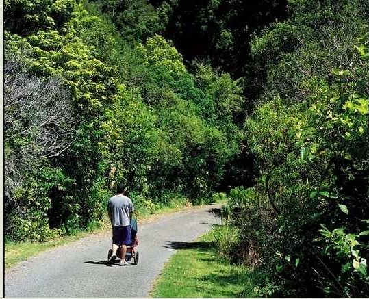
Easy walking track to the Strainer House

Nearly half of Wellington's water is drawn from the Hutt River within the park. As a result, there are several sealed vehicle-free tracks. All toilets are wheelchair accessible.