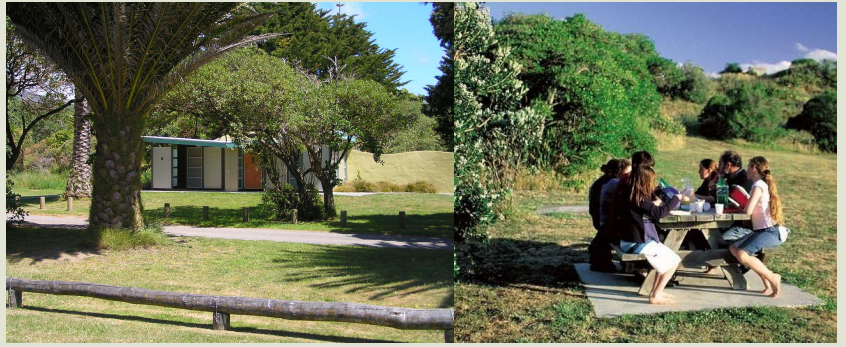
New loos at Paekakariki; picnic near the beach

The last area of relatively natural dunes on the Kapiti coastline, Queen Elizabeth's Park sandy beaches, warm climate and easy terrain make it our most popular regional park. Offering plenty of space for walking, picnics, swimming, fishing, cycling and group events, the park is the site of two historic pa and once housed up to 20,000 US Marines during World War II.