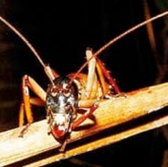
Weta