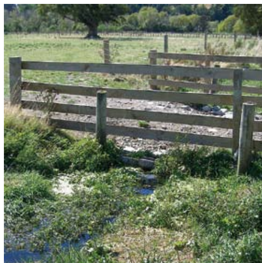
A well-fenced section of a stream