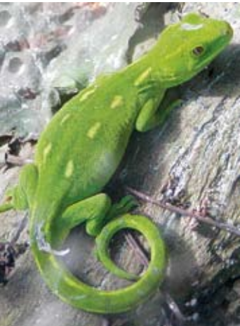
Green punctatus gecko