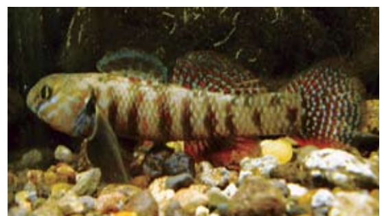
Male redfin bully