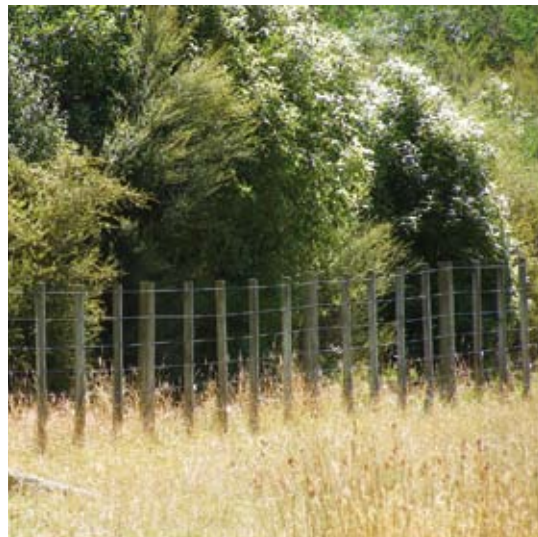
Well-fenced plantings on a stream margin

In the long term, not only will the stream be healthier and much more attractive, you will also see more native birds in the neighbourhood. The stream will have cleaner water that will be more palatable to stock. You may even find that the stream becomes a feature that adds value to your property.