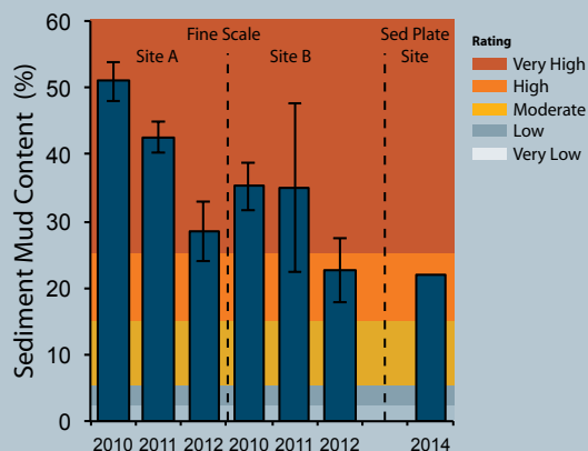
Figure 3. Sediment mud content (+/-SE, n=3), Hutt Estuary, 2010-12, 2014*.