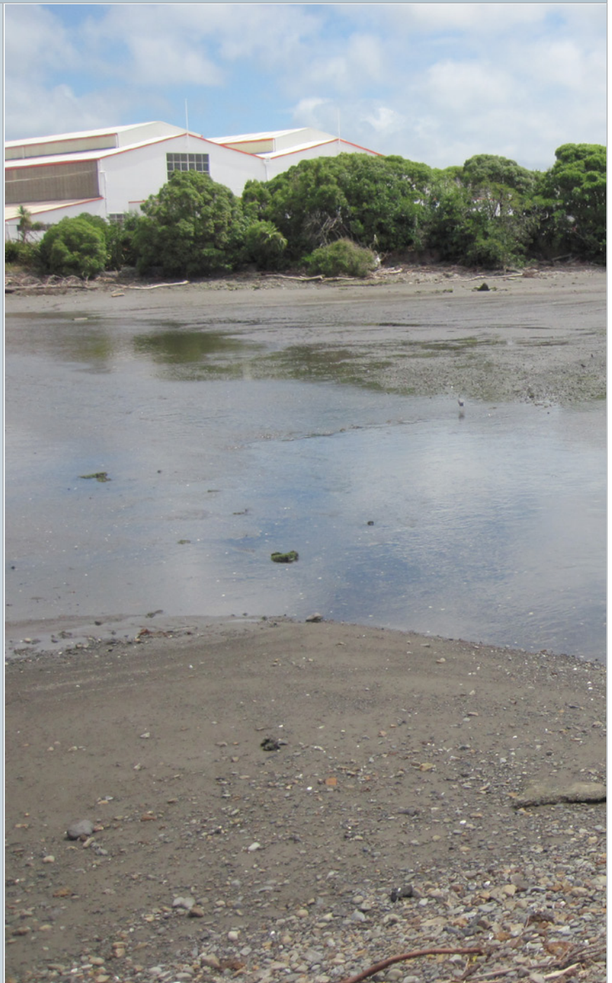
Intertidal flats in the lower Hutt Estuary, Jan 2014