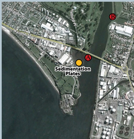
Figure 1. Location of intertidal sediment plates and fine scale monitoring sites in the lower Hutt Estuary.

Prepared for Greater Wellington Regional Council by Leigh Stevens and Barry Robertson, Wriggle Coastal Management, March 2014