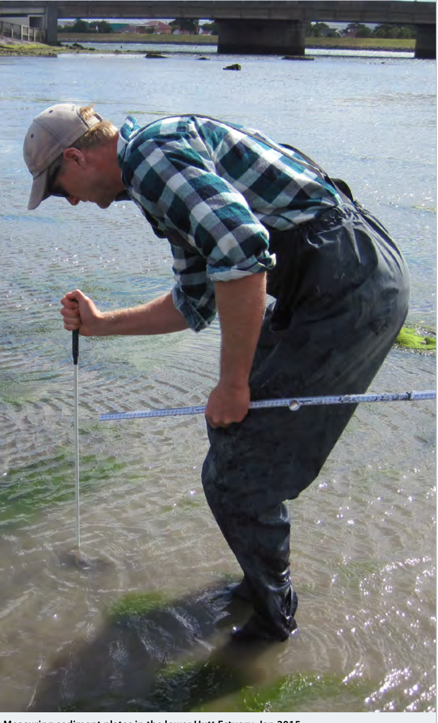
Measuring sediment plates in the lower Hutt Estuary, Jan 2015.