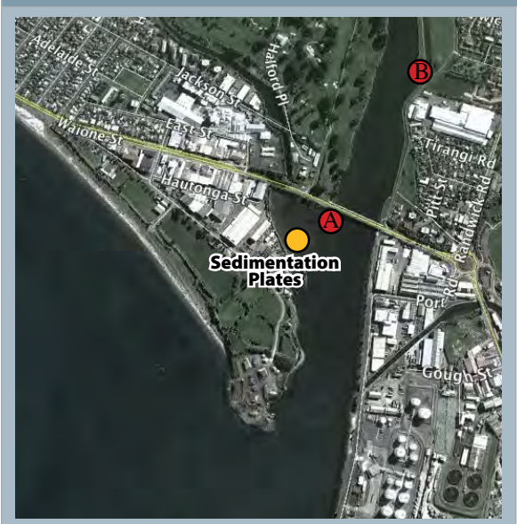
Figure 1. Location of intertidal sediment plates and fine scale monitoring sites in the lower Hutt Estuary.