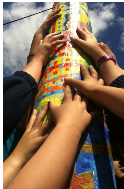
Masterton Primary School Walking Pou