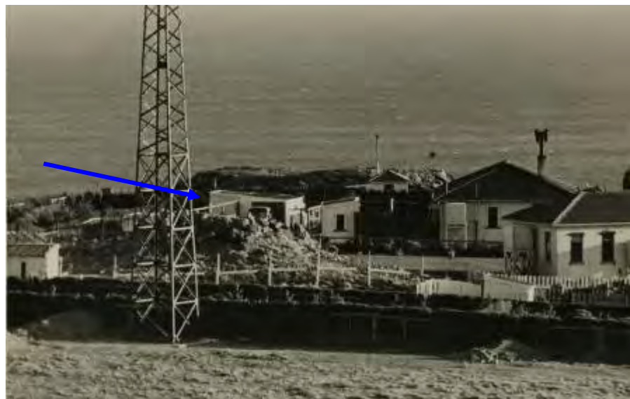
Figure 6: A detail of the above photograph showing second garage (signified with an arrow) and another building no longer extant at extreme left of photograph. Towards the top of the photograph another building has not been identified. Photographed 17 August 1937 by an unidentified Evening Post staff photographer. (EP-Transport-Shipping-Lighthouses-01, Alexander Turnbull Library.)