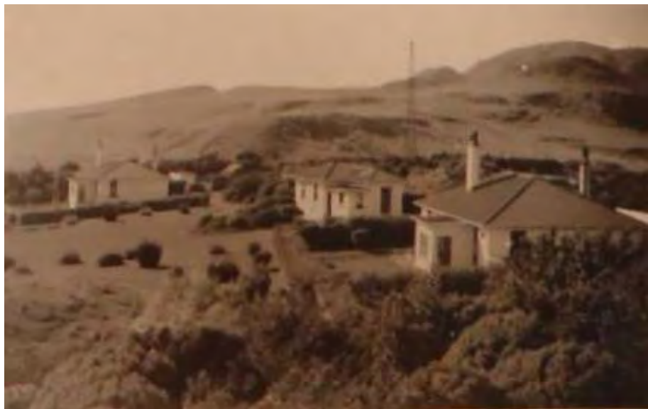
Figure 8: The lighthouse keeper's houses showing additions to the front of the houses. Date unknown.