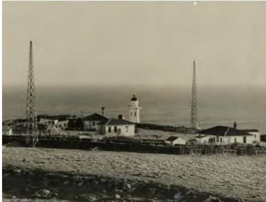
Figure 5: Baring Head Lighthouse Complex. Photographed 17 August 1937 by an unidentified Evening Post staff photographer, (EP-Transport-Shipping-Lighthouses-01, Alexander Turnbull Library).