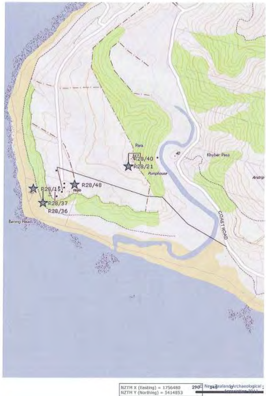
Figure 2: Archsite image for archaeological sites in the vicinity of the lighthouse complex ( www.archsite.org.nz )