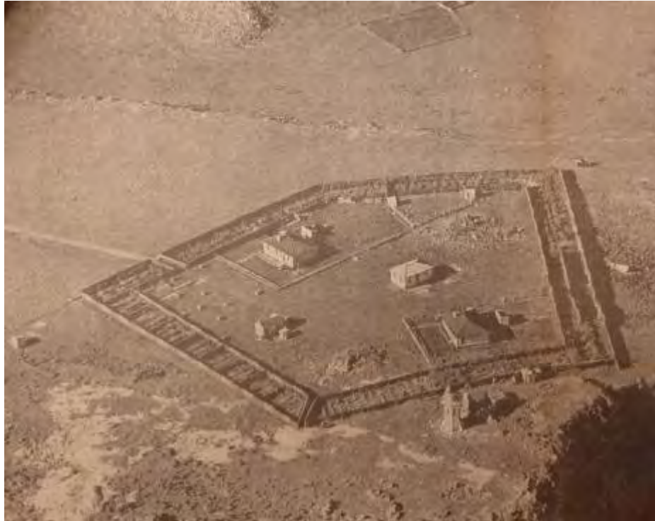
Figure 7: Aerial photograph showing the lighthouse complex in 1935. Photographed 1935 by an unidentified photographer, from the Evening Post April 9 1935. (Baring Head - origin - general, M1 769 8/62/1, Archives New Zealand).