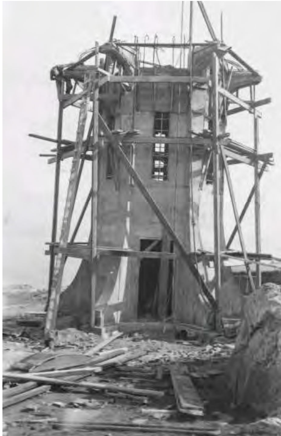
Figure 4: Baring Head Lighthouse tower under construction in March 1934. (EP-Transport-Shipping-Lighthouses-02, Alexander Turnbull Library)