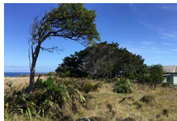
Gaps in the shelter belt need to be replanted, supported by windbreak fencing until plants establish in this exposed location.

It's still a windy place but made calmer by the shelter belt which also provides habitat for wildlife and birds.