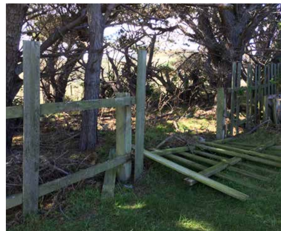
The shelter belt fence needs replacing and missing vegetation restored.