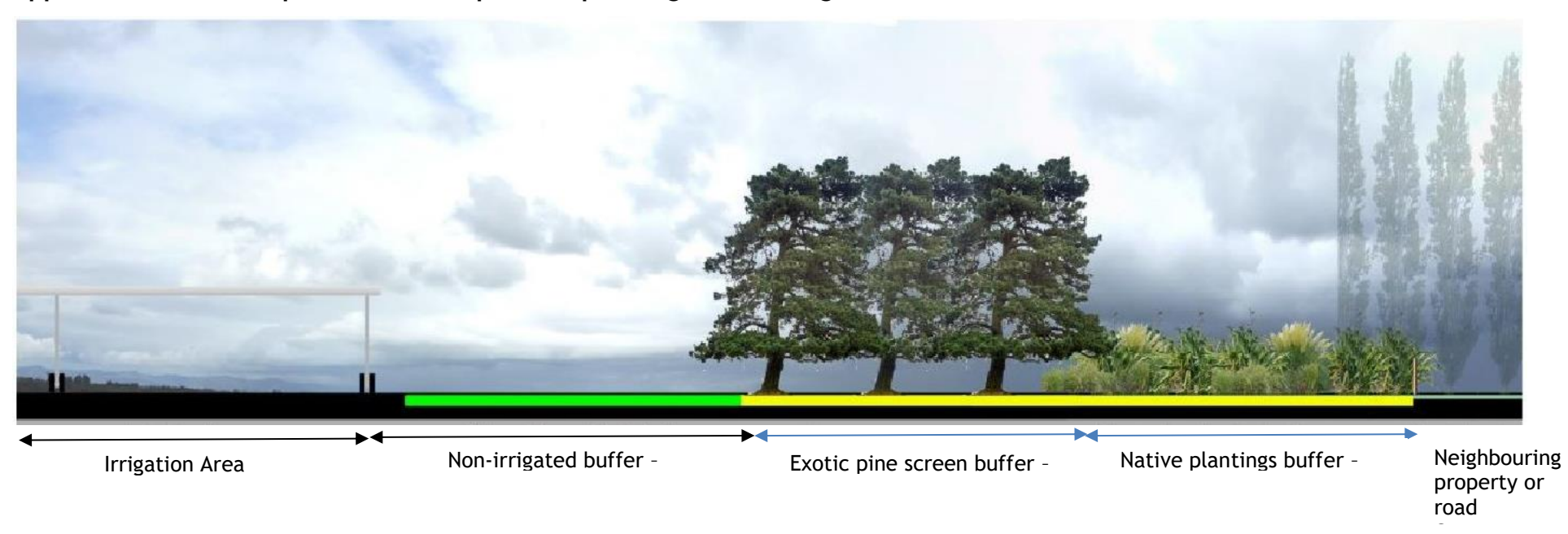
Appendix A - Visual representative of planned planting around irrigation areas