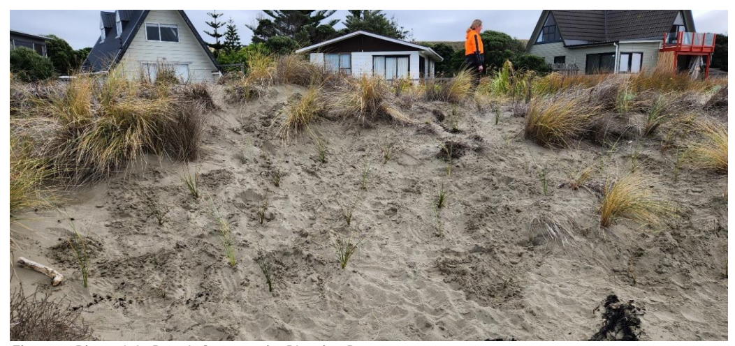
Figure 2: Riversdale Beach Community Planting Day

Government Funding – Department of Prime Minister and Cabinet (DPMC) – Cyclone Recovery Unit