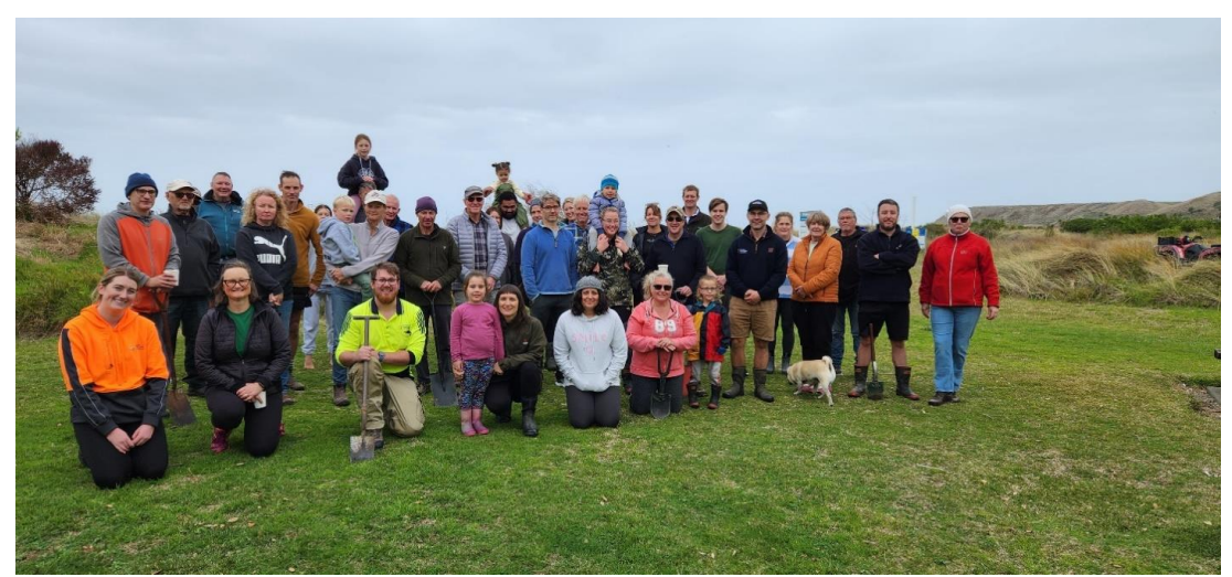
Figure 1: Riversdale Beach Community Planting Day

40. The annual community planting day out at Riversdale beach was a great success. Approximately 1,000 plants went into the ground along the dune system, supported by 40 people from the community.