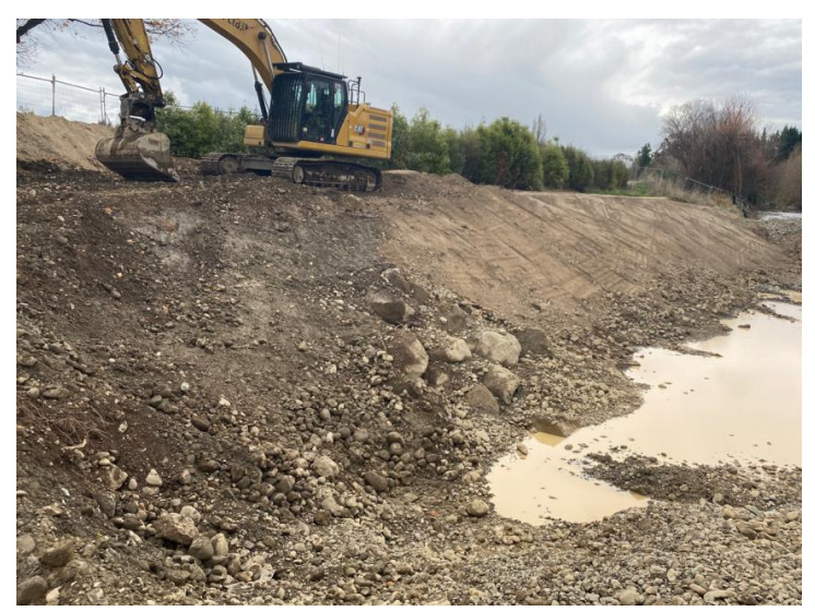
Figure 6: Stage two (Waipoua River) – 1,000 tonne rock groyne completed within the Waipoua River