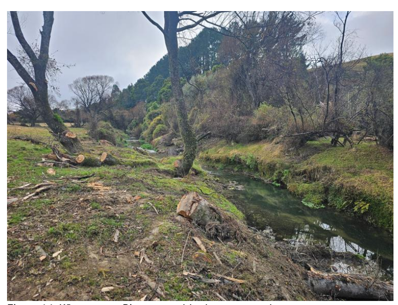
Figure 14: Kōpuaranga River – post blockage removal