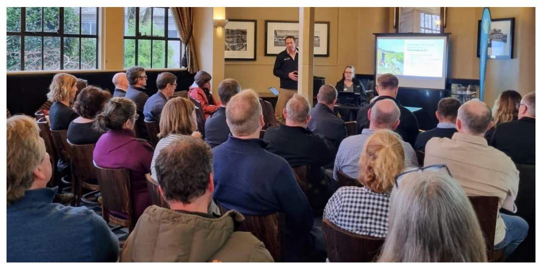
Figure 5: The Wairarapa Catchment Collective