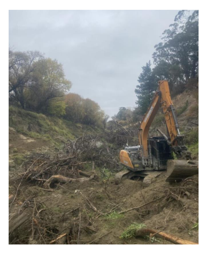
Figure 4: Whareama River – blockage removal commenced