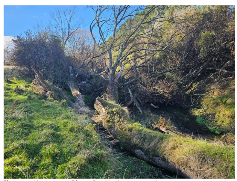
Figure 13: Kōpuaranga River – Pre blockage removal

Below are some images of blockages and removals.