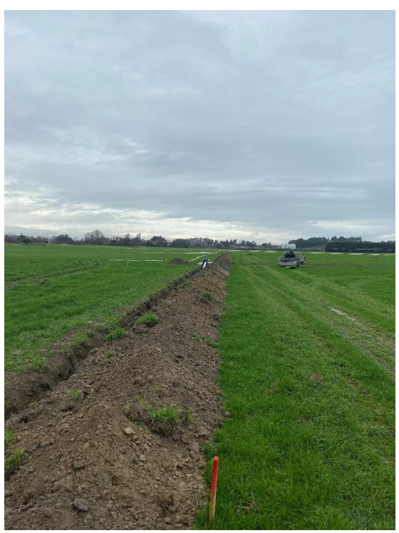
Figure 16: Daleton Nursery irrigation construction underway