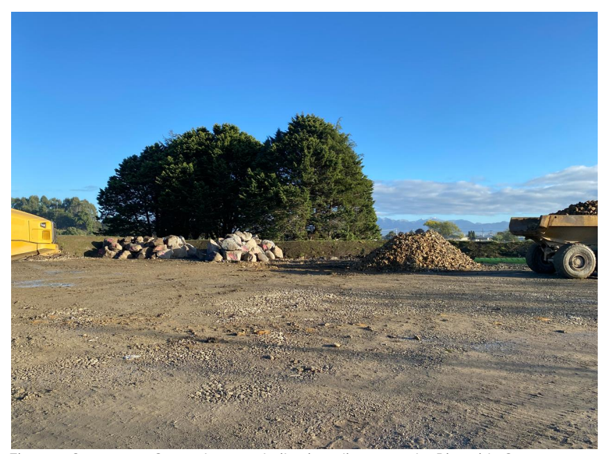
Figure 9: Stage two – Secondary stockpile site adjacent to the Riverside Cemetery