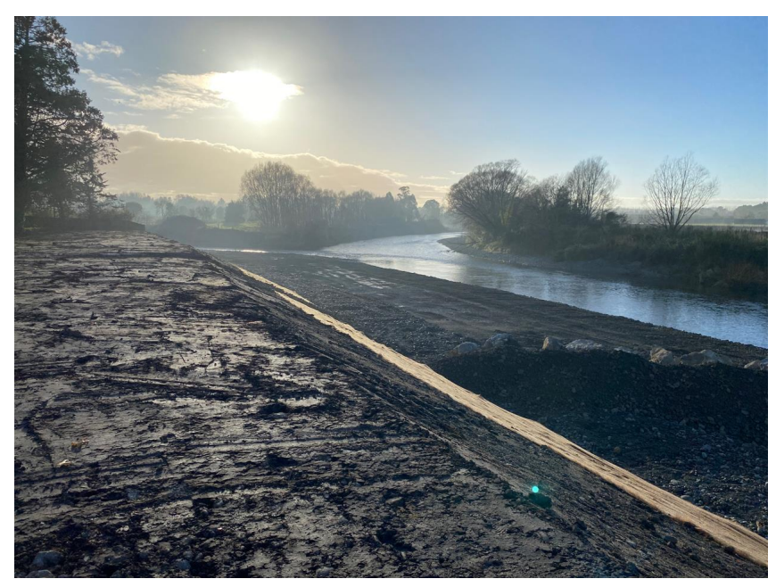
Figure 12: Stage two (Ruamāhanga River) – A section of the rock revetment within the Ruamāhanga River is completed. The temporary bunding has been retreated. This photo overlooks the confluence of the Waipoua and Ruamāhanga Rivers