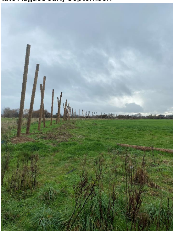
Figure 15: Daleton Nursery 6m artificial shelter construction

69. Progress has been steady throughout the winter period to date. Irrigation infrastructure and artificial shelter belts are currently being constructed. The intent is to have irrigation operational sometime during October 2024 when we will be able to commence the application of treated wastewater to ground. The artificial shelterbelts will be supplemented with planted shelter and this combined protection will ensure that the production nursery is well sheltered when planted in late August/early September.