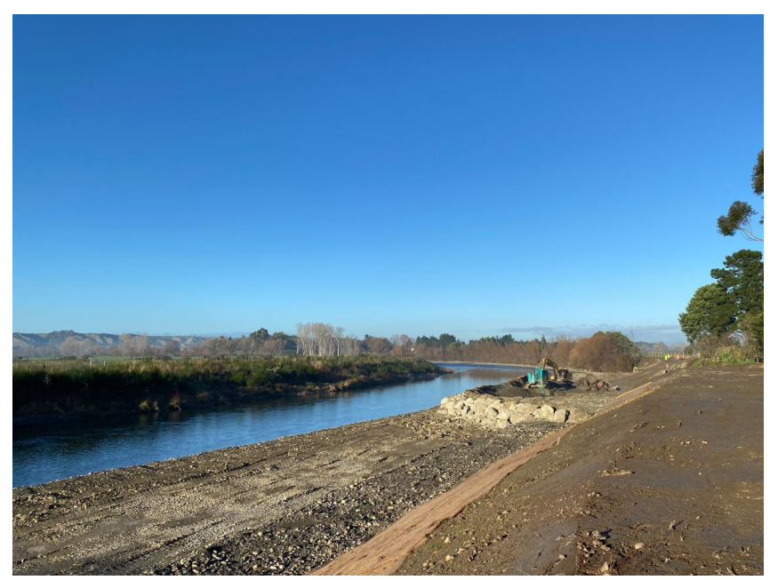
Figure 10: Stage two (Ruamāhanga River) — Construction of the rock revetment continues within the Ruamāhanga River