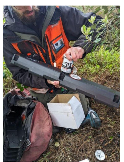
Figure 18: Installation of H2 Zero unit on a secure bait station