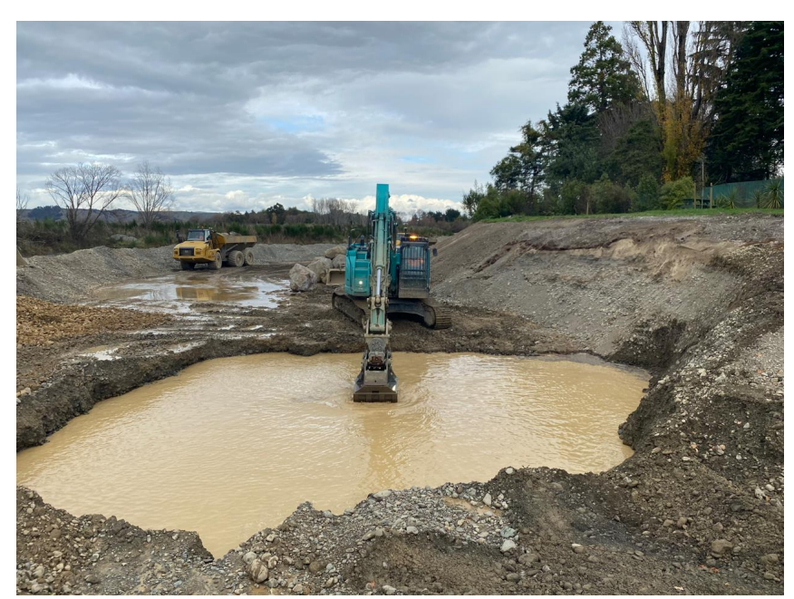
Figure 7: Stage two (Waipoua River) – Excavation of the rock revetment within the Waipoua River (the excavation is bunded from the Waipoua River and is not within the flow of the river)