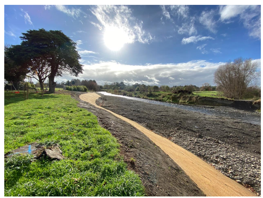
Figure 8: Stage two (Waipoua River) – Rock groyne and rock revetment completion within the Waipoua River. Coconut matting has been installed to the battered river bank above the rock revetment